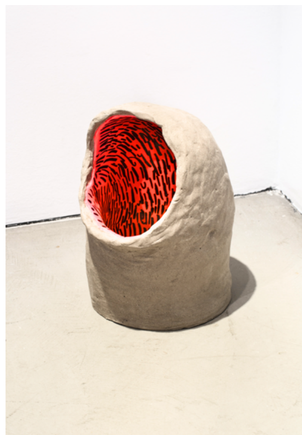
Teresa Solar Abboud Forma de fuga , 2020 Baked clay, resin, paint and ink 40 x 30 x 30 cm Courtesy of the artist and Galería Travesía Cuatro