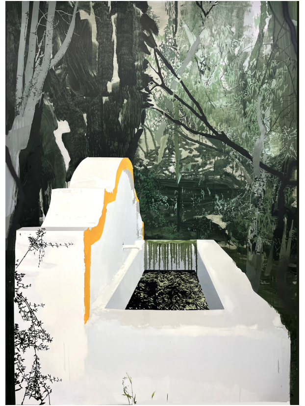
Julia Santa Olalla Pilar Cubana , 2023 Oil on linen 250 x 179 cm