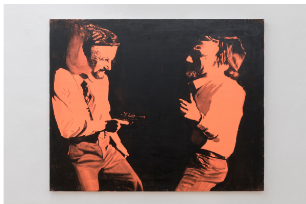
Pere Llobera Vayámonos matando ya, 2013 Oil on canvas 81 x 100 cm