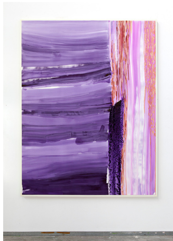
Vicky Uslé Moving Through , 2023 Dry pigment, graphite, and pastel on paper 200 x 150 cm