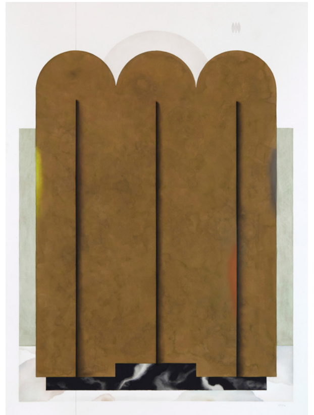
Elena Alonso Diseño para un cuerpo voluptuoso (9) , 2022 Mixed technique on paper 190 x 137 cm

Marlborough Calle Orfila nº 5 28010 Madrid info@galeriamarlborough.com galeriamarlborough.com