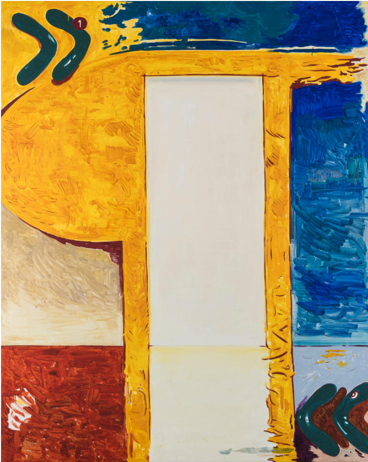
Rasmus Nilausen Memorial Gate , 2019 Oil on canvas 200 x 160 cm